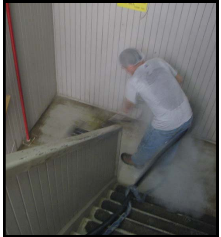
Using floor suction tool to clean landing of mustard and dirt “tar”. To speed cleaning, detergent is added in a parallel circuit with the steam. The suction capability removes the water, detergent and dissolved soils leaving the floor clean and dry.