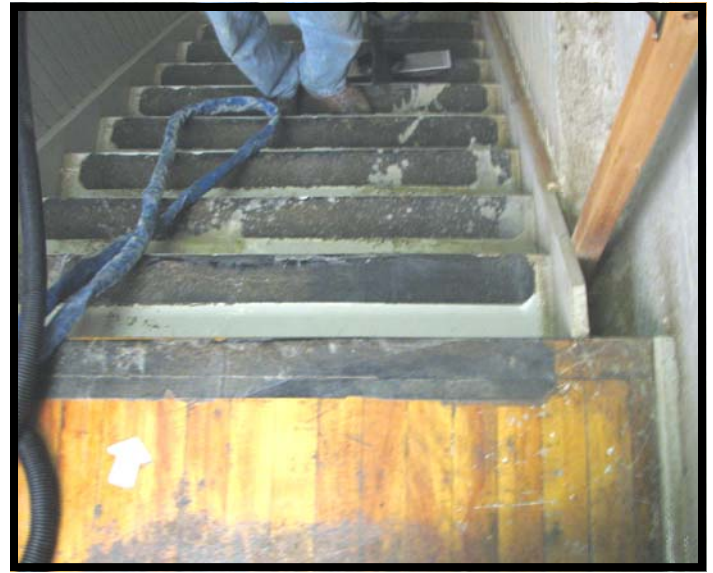
Mustard and dirt “tar” removed from hardwood floor and first wooden step as preparation for repainting. Brush tool and stainless steel brushes used.